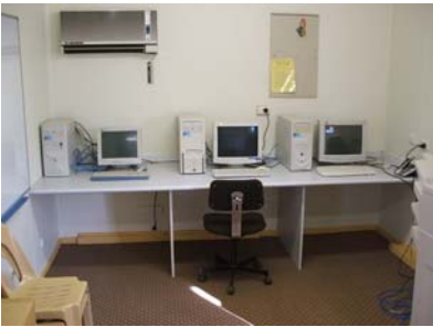
Community Computers- Three computers set up for training purposes

There have been some successful programs run throughout December –January. The cleaning up of the office area and development and implementation of the computer workstations look sensational and should give the new Officers a good head start.