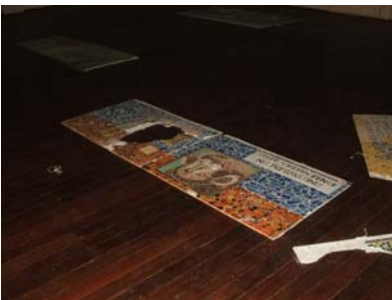
Mosaics- material has arrived and currently being attached to backing boards. Will be ready for people to repair in Feb 2007

The HCP officers left the meeting at 12.08pm.