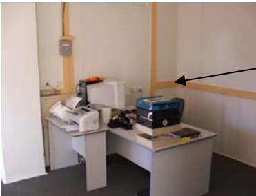
CCB Workstation HCC Workstation